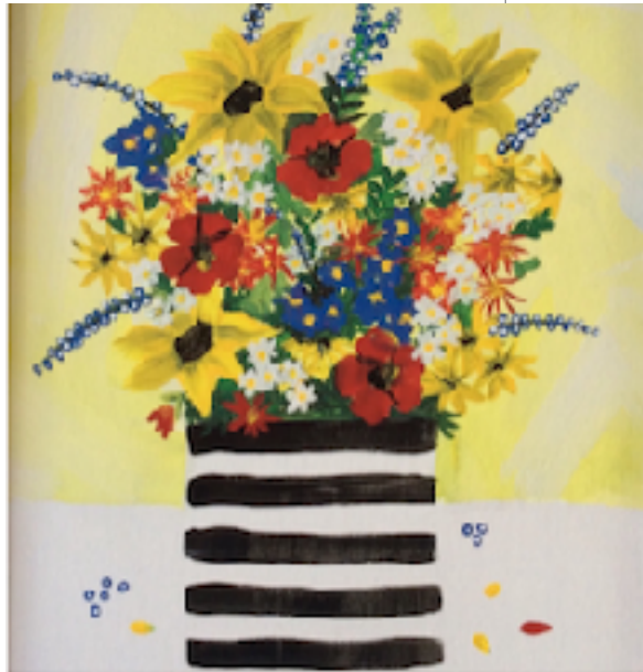
2018 Art Work