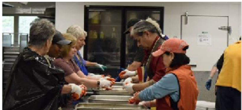
2018 Shrimp Head Popping Camp Parson

Shrimp Sales in conjunction with Emerald Towns Alliance. The fundraiser was possible thanks to the 40 Brinnon Parks and Recreation District community volunteers processing 1,251 pounds of shrimp into 846 packages ready for sale. We are thankful for the use of the Camp Parsons' kitchen making the process easier for the volunteers. The Shrimp Sale was on Memorial Day Weekend at the Brinnon Community Center and Quilcene/Brinnon Garden Club Plant Sale. On Memorial Day Weekend, Monday, just after 3:00pm we sold out. In part, thanks to the Garden Club providing us space to sell at their event. The fundraiser yielded $4,639.06 to be divided evenly by both organizations. However, Emerald Towns Alliance (ETA) generously voted to donate their shrimp sales proceeds back to the Brinnon Parks and Recreation District. This donation will ensure the District makes its events/programs goal for the year and is very much appreciative of ETA support.