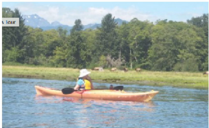
Dosewallips Kayak Tour

We are working with community and public/private sectors to provide programs/events in 2018. See our website www.brinnonparksandrec.org or Facebook to learn more about our programs/events.